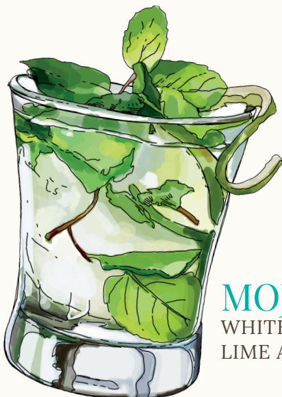
MOJITO $19 WHITE RUM, MINT LEAVES, LIME AND SODA